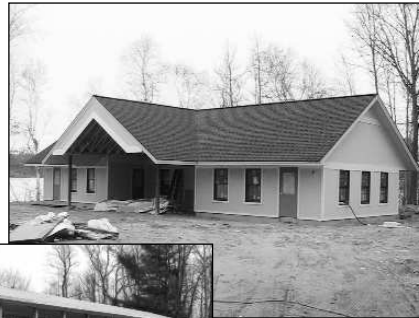
Top: One of two new Boys' Village Lodges, March 2008

There will be many new things at Camp Henry this summer but we look forward to the campers arriving and making the new part of their old traditions.