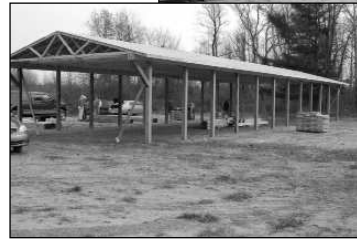
Left: New Tack House, November 2007